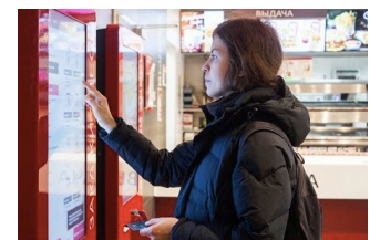
Up : VP6800